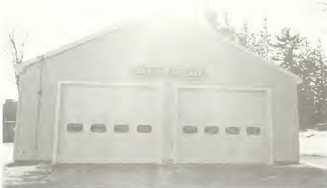
On October 29, 1995, an Open House was held at the newly-constructed Newmarket Ambulance Facility located on Terrace Drive.